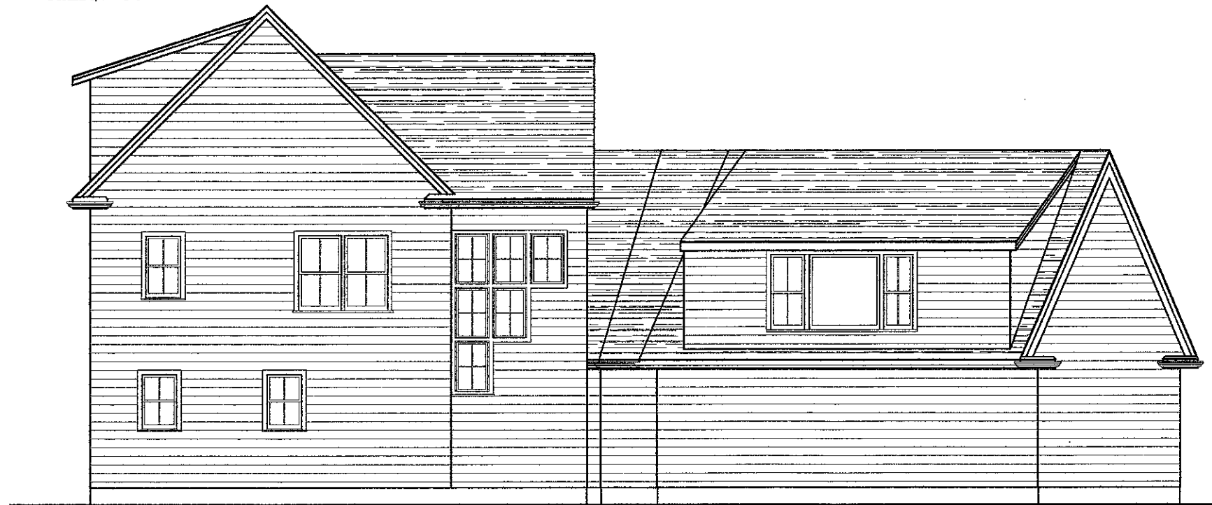
SIDE ELEVATION SCALE 1/4" = 1'-0"