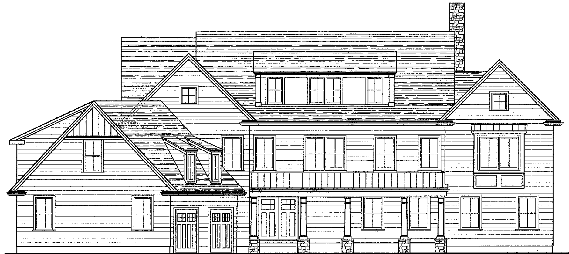
ENTRY ELEVATION SCALE 1/4" = 1'-0"