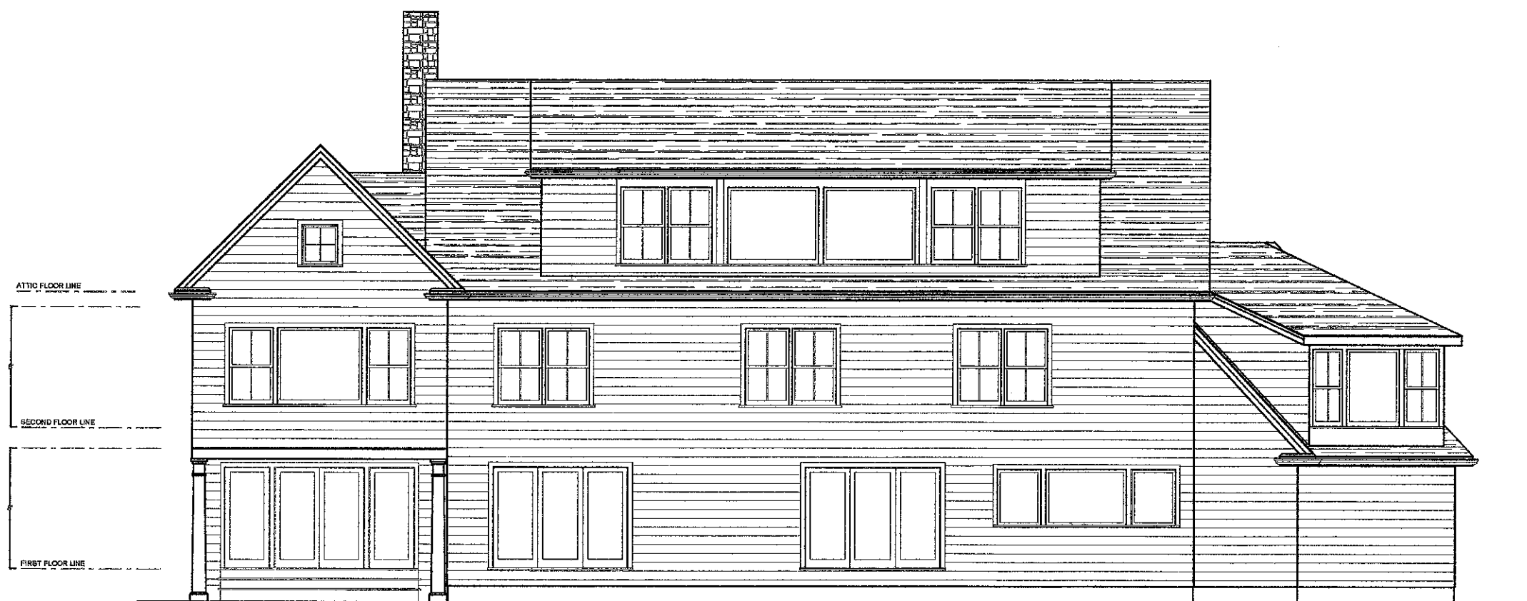
REAR ELEVATION SCALE 1/4" = 1'-0"