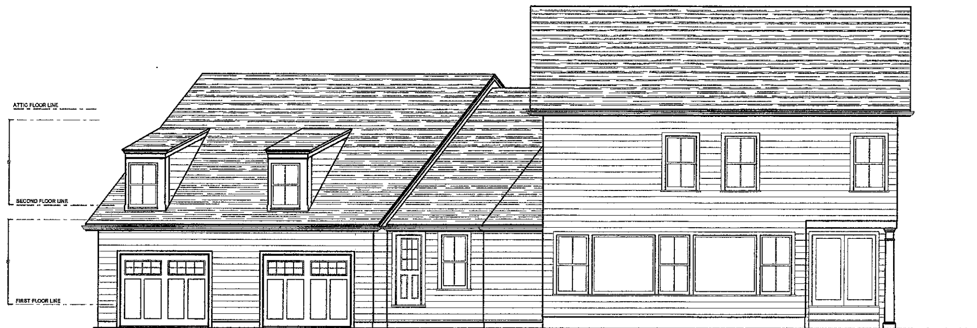
SIDE ELEVATION SCALE 1/4" = 1'-0"