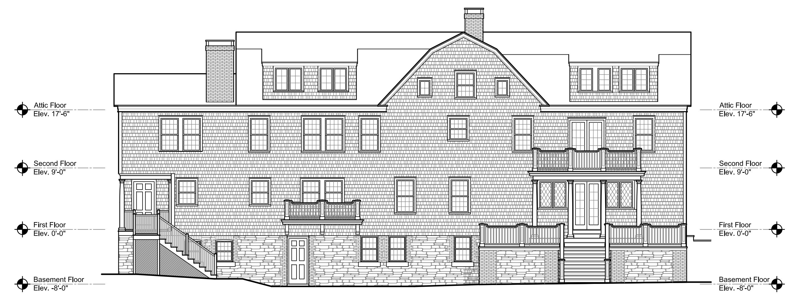
F6 WEST ELEVATION - EXISTING 1/8" = 1'-0"