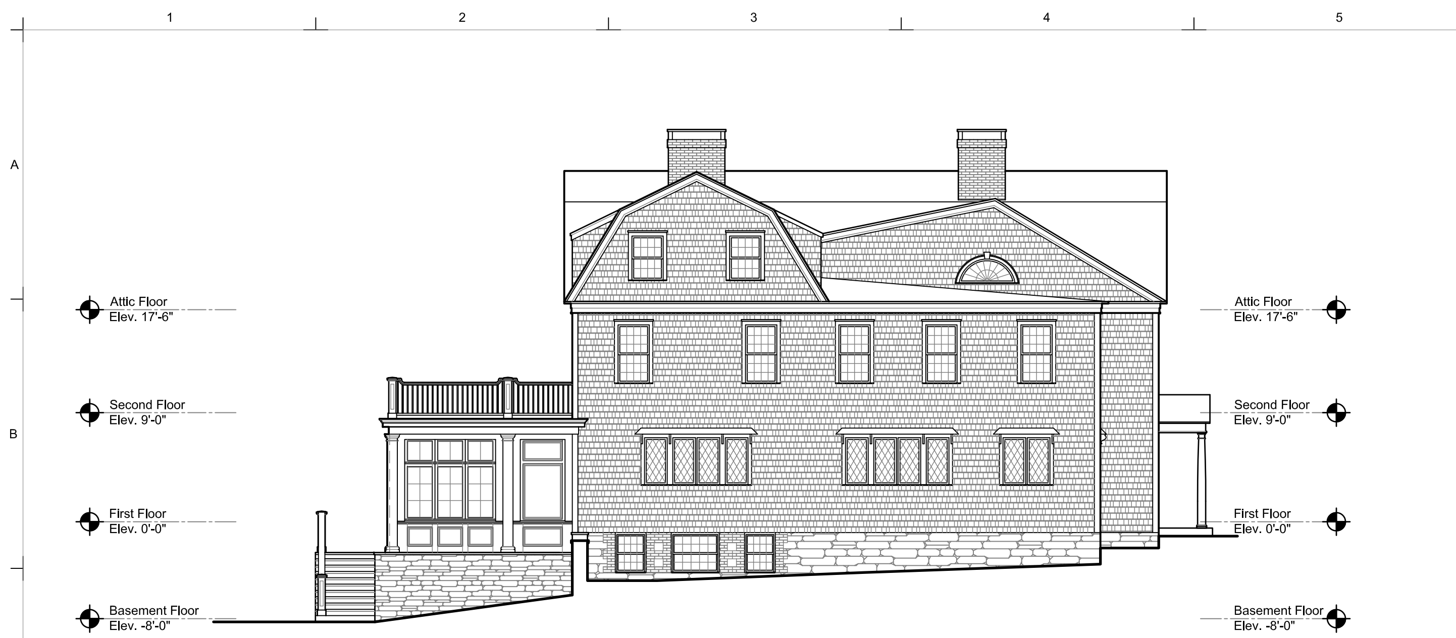
C1 NORTH ELEVATION - PROPOSED 1/8" = 1'-0"