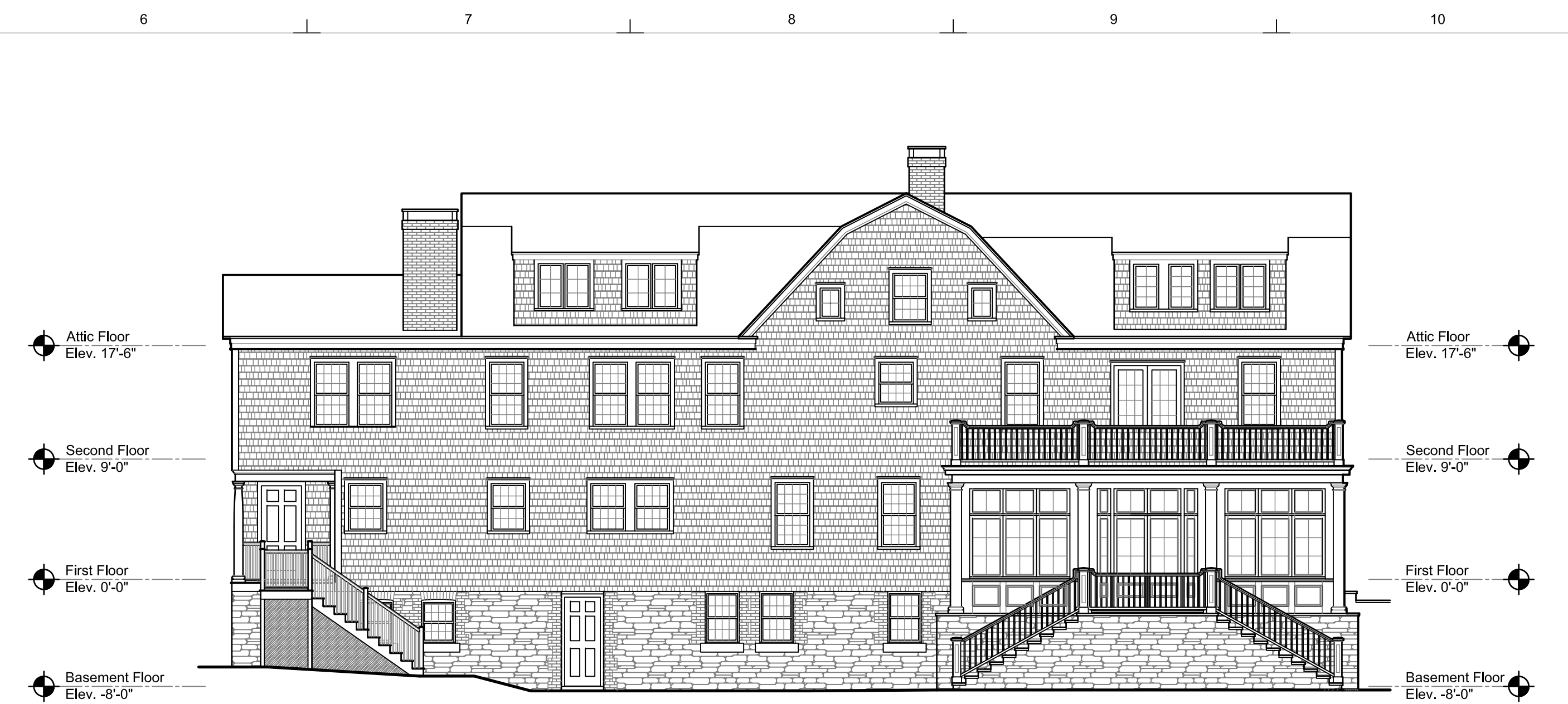
C6 EAST ELEVATION - PROPOSED 1/8" = 1'-0"