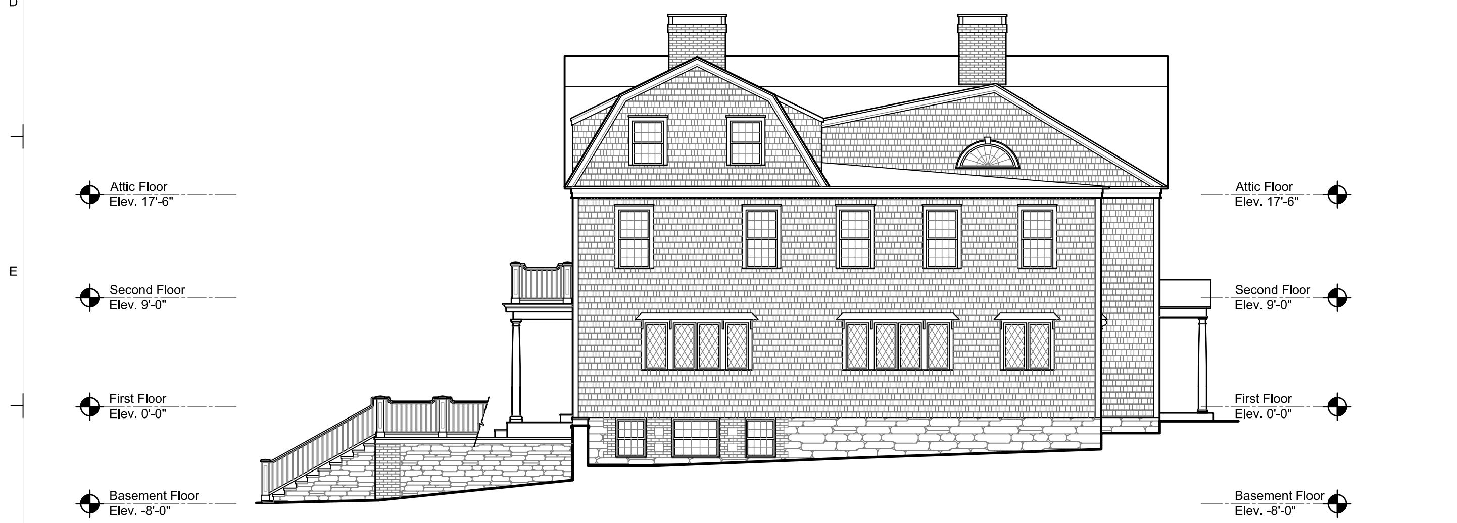
F1 SOUTH ELEVATION - EXISTING 1/8" = 1'-0"