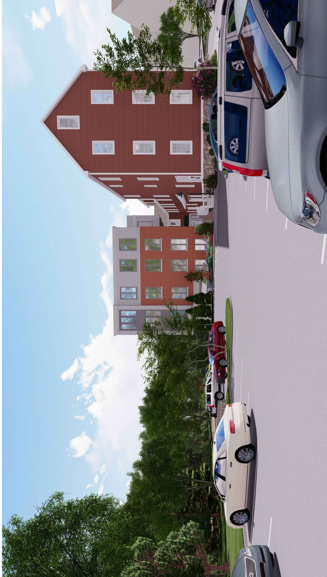
① SOUTH FACING PERSPECTIVE - VIEW FROM PROSPECT ST SCALE: N/A