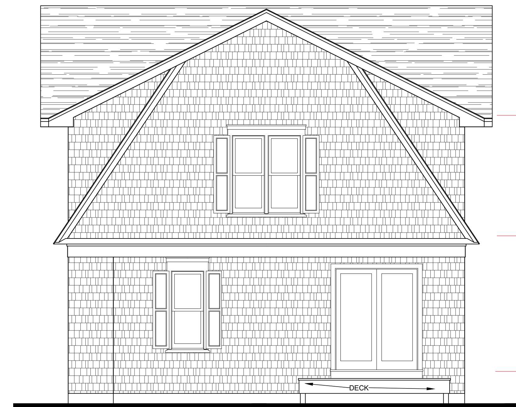
REAR ELEVATION SCALE 1/4" = 1'-0"