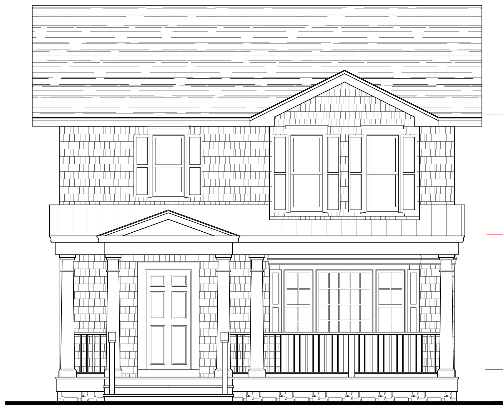
ENTRY ELEVATION SCALE 1/4" = 1'-0"