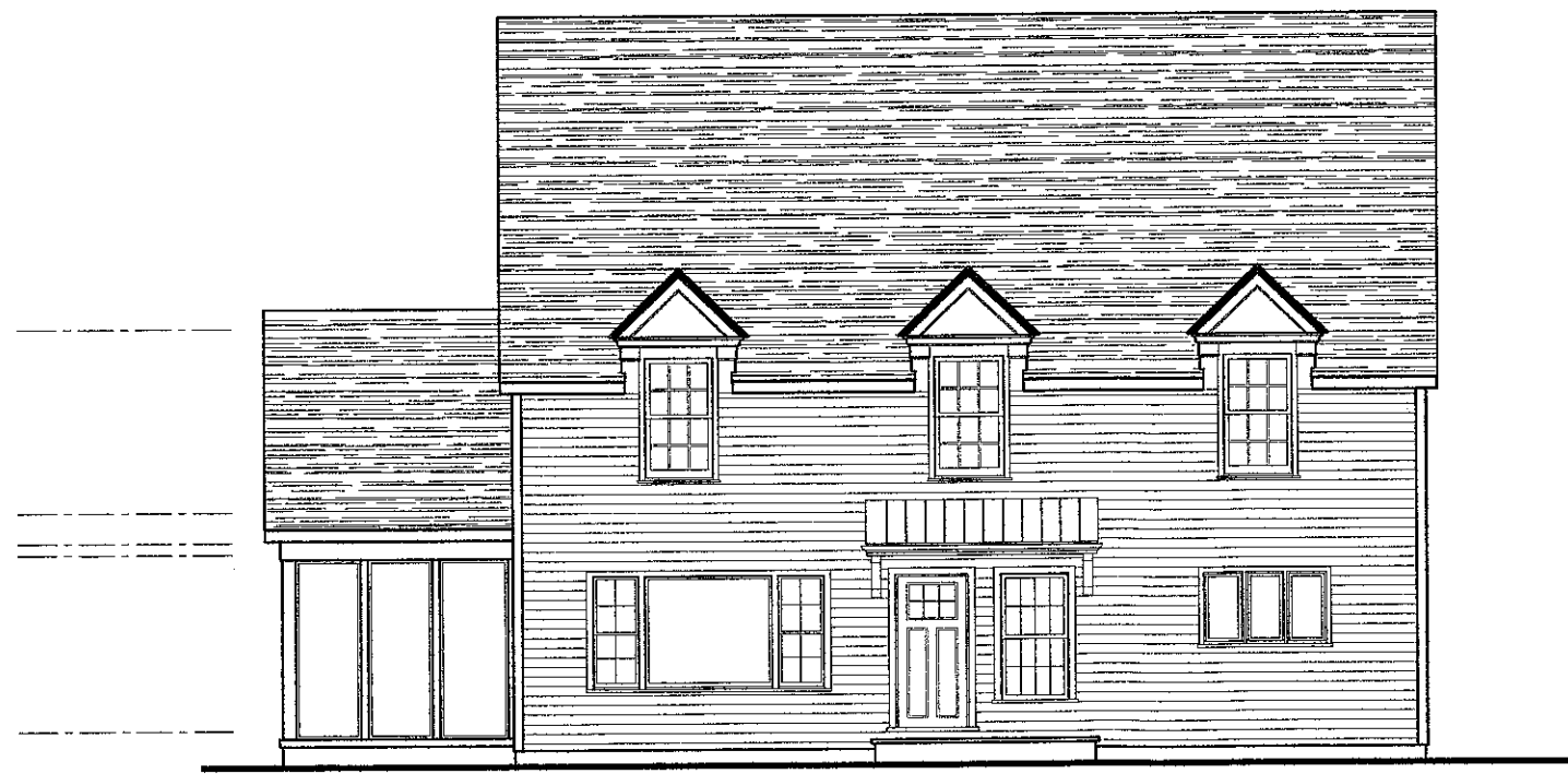
ENTRY ELEVATION 6'-0" KNEE WALL SCALE 1/4" = 1'-0"