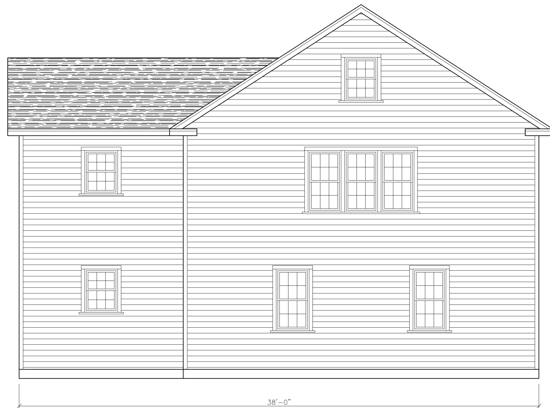
LEFT VIEW SCALE 1/4"=1'-0"