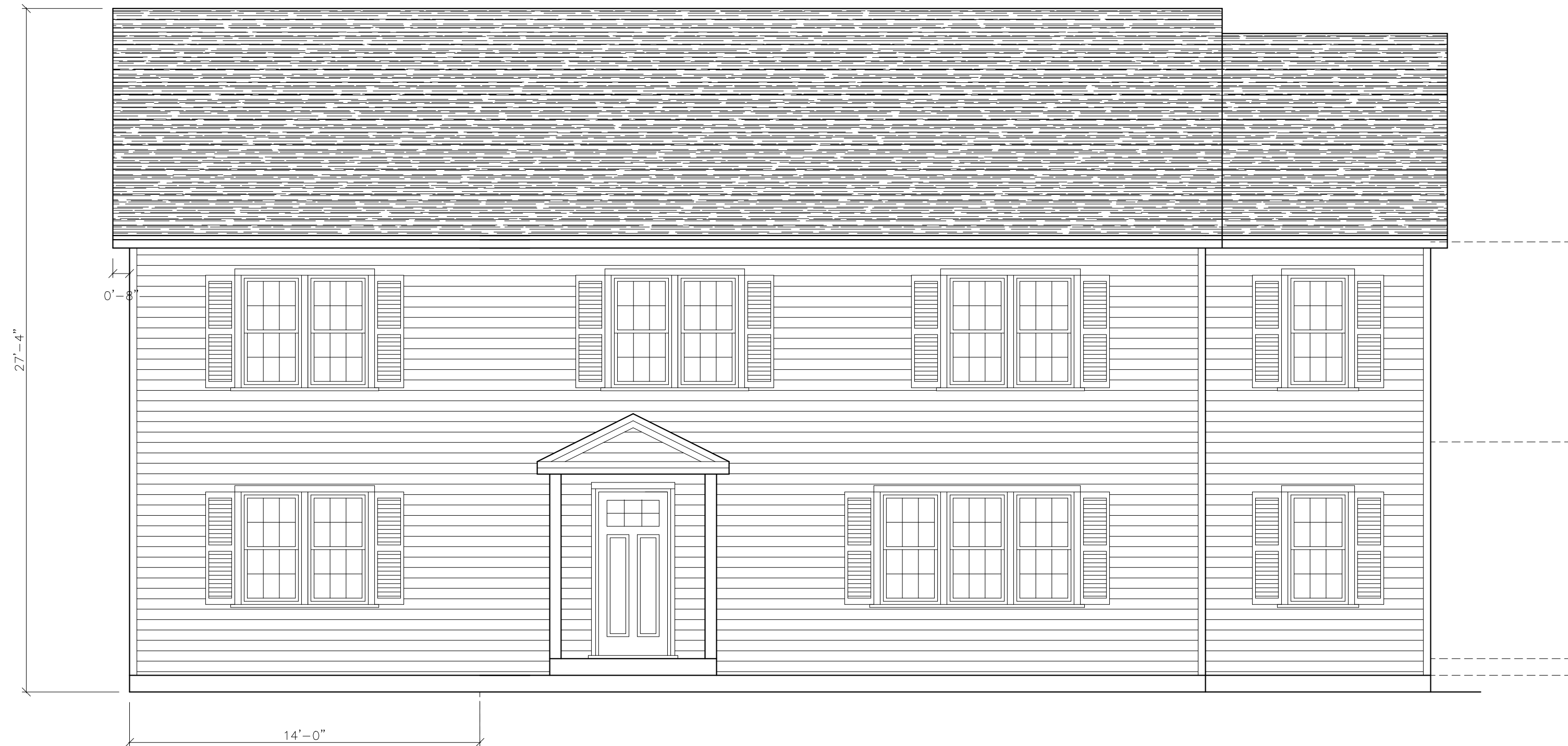
FRONT VIEW SCALE 1/4"=1'-0"