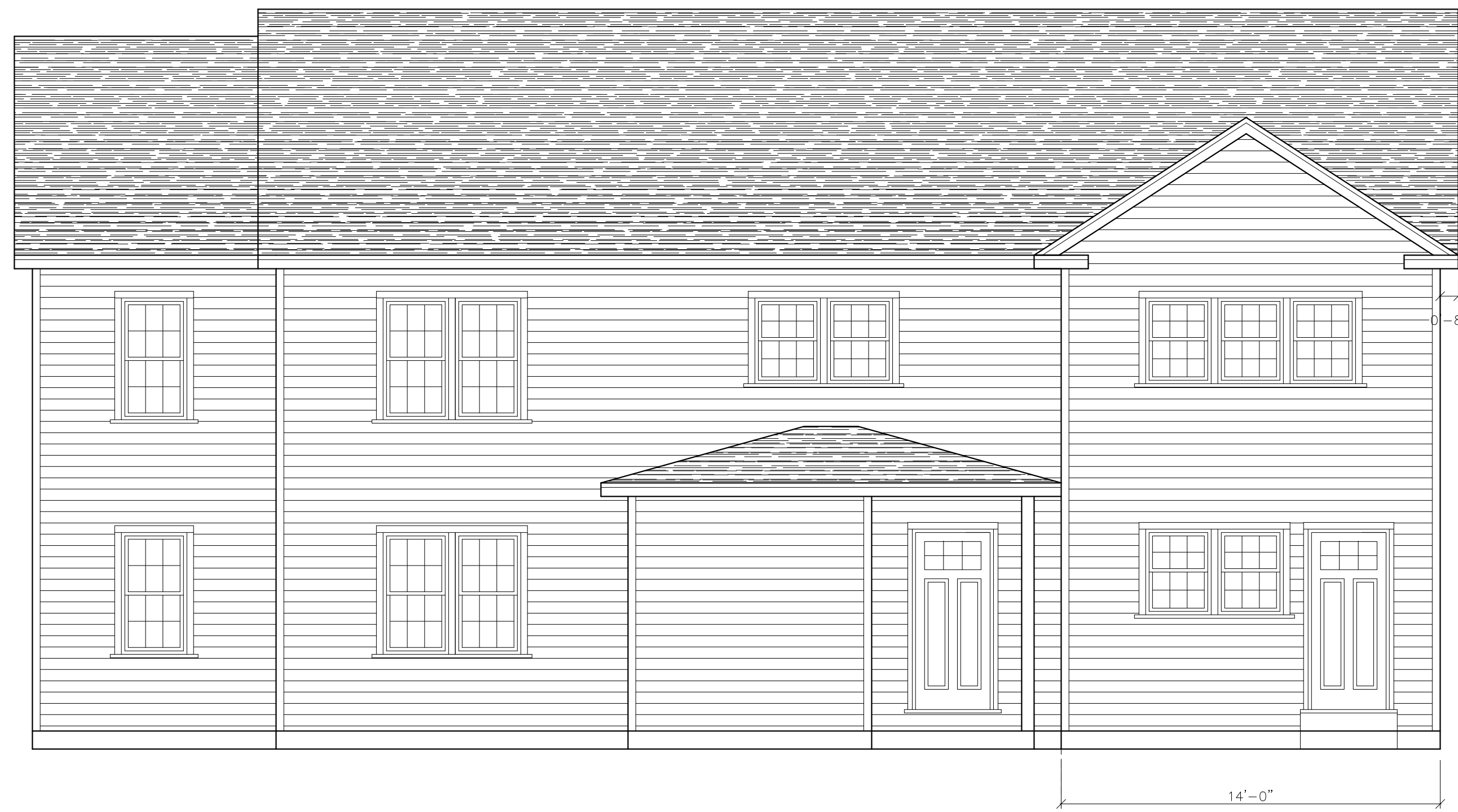
REAR VIEW SCALE 1/4"=1'-0"