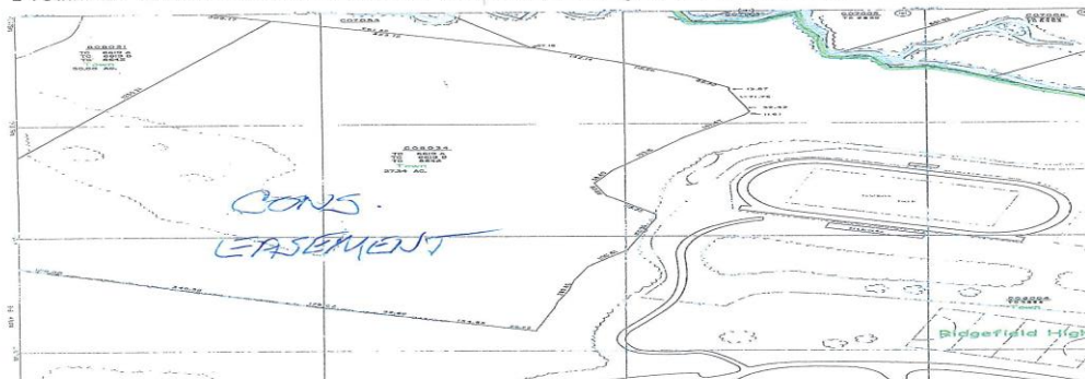
Name: C08-0034 North Salem Rd (27.34 acres)

Notes: C08-0034 (27.34 acres) Regionally inventoried wetlands throughout. Low-lying riparian zone/habitat for the Titicus River and local tributaries. CT Fish sampling data shows indicates presence of Brook trout within this reach of the Titicus River. Parcel contiguous with other Town of Ridgefield open space parcels B08-0051 (30 Acres), C07-0054 (5.7 acres) C07-0056 (2.59 acres) Parcel can be accessed from Ridgefield High School grounds or Ridgebury Road (from the east or the north). Ridgefield High School has proposed a trail loop into this open space to allow class groups to investigate outdoor habitats that would include vernal pools and wetlands.