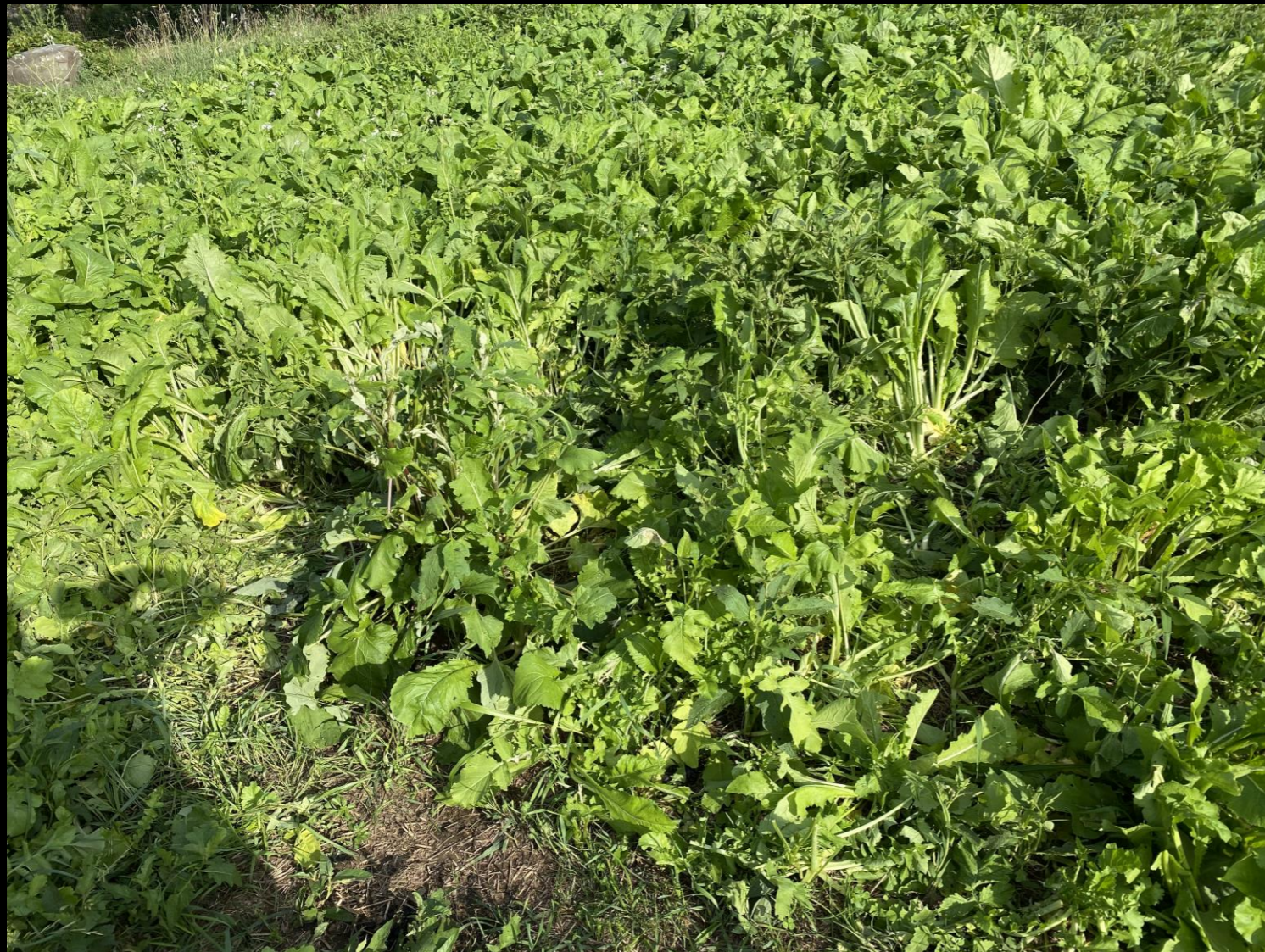
Winter Waste Hay area in early Summer after planting Ray's Crazy Mix