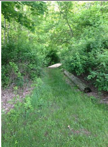
Trail head at Ridgebury Slope